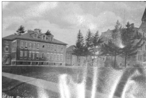
An early depiction the 1902 school building at 141 Davis Street, which currently houses the Greenfield Public Schools administrative offices.