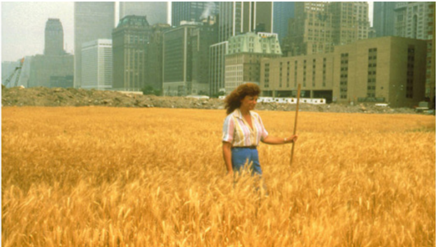
WHEATFIELD BY AGNES DENES

Agnes Denes planted a two-acre field of wheat on a landfill in Manhattan. This in and of itself was political; she grew life and food from forgotten trash, two blocks from Wall Street and the World Trade Center, looking out at the Statue of Liberty. She cared for the crop and was able to eventually produce 1000 pounds of healthy wheat.